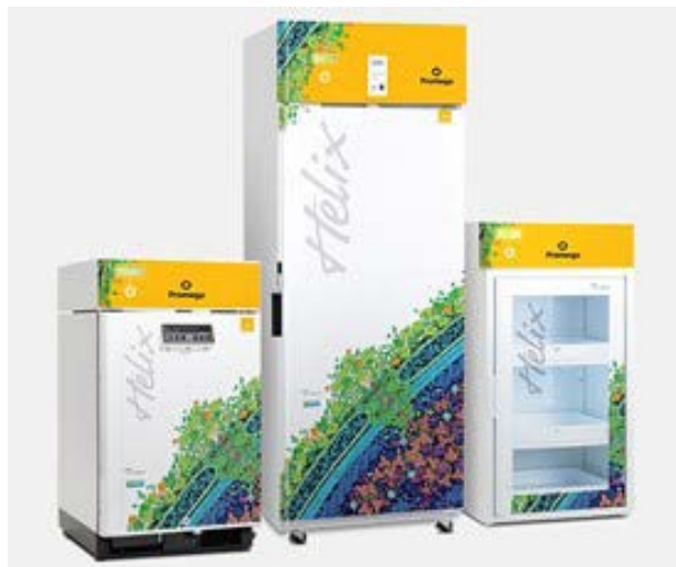
Examples of some different Helix® units.

We utilize state-of-the-art RFID technology to provide convenient on-site stocking. Our inventory management system ensures you have what you need, when you need it.