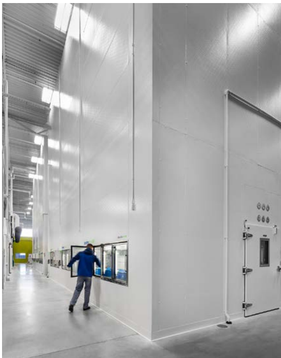
Vertical Lift Module (VLM) storage and retrieval system.

In addition to our standard equipment, we utilize the automated storage and retrieval system (VLM or Vertical Lift Modules) which allow for 400lb-capacity, high-density vertical storage up to 35-feet high.