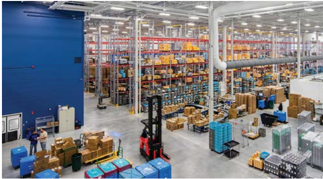
A look at the inside of the Kepler Center.

The Kepler Center houses our state-of-the-art warehouse with ample capacity for ambient, +4°C, -20°C, -70°C and -140°C cryostorage space. This includes 1,000 square feet of +4°C storage, 7,500 square feet of -20°C storage and 21,000 unique individual product storage locations.