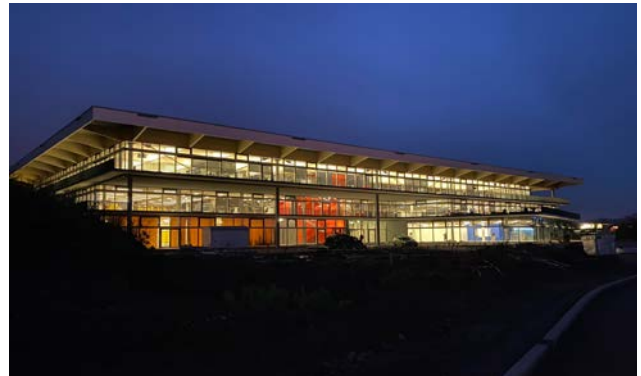
One of the new distribution facilities in Walldorf, Germany.

Promega also has two regional distribution centers in Germany (Euro hub) and Singapore, as well as smaller local distribution centers in the United Kingdom, South Korea, China, Australia, Japan, India and Brazil. Promega maintains the inventory stock for local order processing at these sites, ensuring timely global delivery of our products to you.