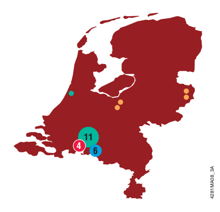
Figure 2. Map of the The Netherlands showing the place of current residence of all Dutch males with the surname "D". Colors correspond with those from Figure 1. Unnumbered circles represent a single male. Numbers in a circle indicate the number of males of each distinct branch.

Superficially, one could ask "why bother using these new markers if one cannot use them in court?". This reply has been given to me many times. I do not believe that Y-STRs are without use and should not be used in court. On the contrary, I think they are very useful. I also do not state that