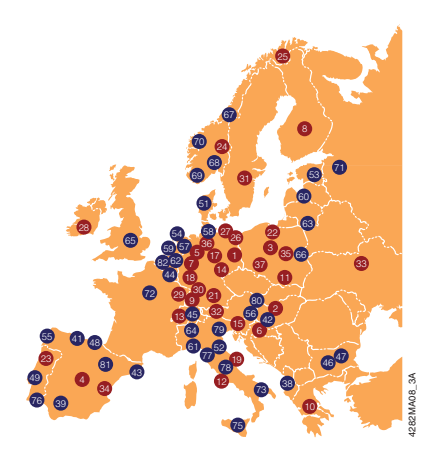
Figure 3. Geographical distribution of the Y-STR Database hits of minimal haplotype D. Blue dots represent populations not containing the D haplotype; red dots indicate centers containing one or more hits with the D haplotype.

the Y-STR Database is useless (as some people think), only that one should realize when and how to use the information therein. Information obtained from the Y-STR Database should be seen as qualitative, not quantitative. A database search provides essential information about the geographic distribution and variation of the frequency among populations of a Y-STR haplotype. This knowledge can be very important since it could suggest that, even if the Y-haplotype has not been observed in your relevent population, it is probably there. Criticism of my careful approach ignores the many cases where suspects are excluded on the basis of nonmatching Y-STR profiles. Even in the case of matching profiles, one presents the prosecution with one valuable piece of technical information, namely that we do not exclude the suspect from being the perpetrator. It is their job to use this piece of information. This sometimes leads to the apprehension of a male relative of the original suspect as the true perpetrator of the crime (6).